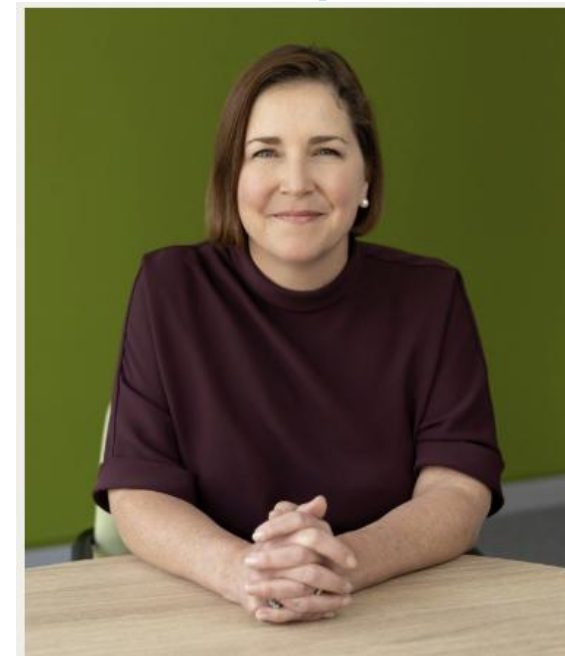
Dame Nicole Jacobs Domestic Abuse Commissioner for England and Wales

Are Domestic Abuse victims still being failed by the Family Justice System?: Domestic Abuse Commissioner Release - Latest news - 42BR Barristers